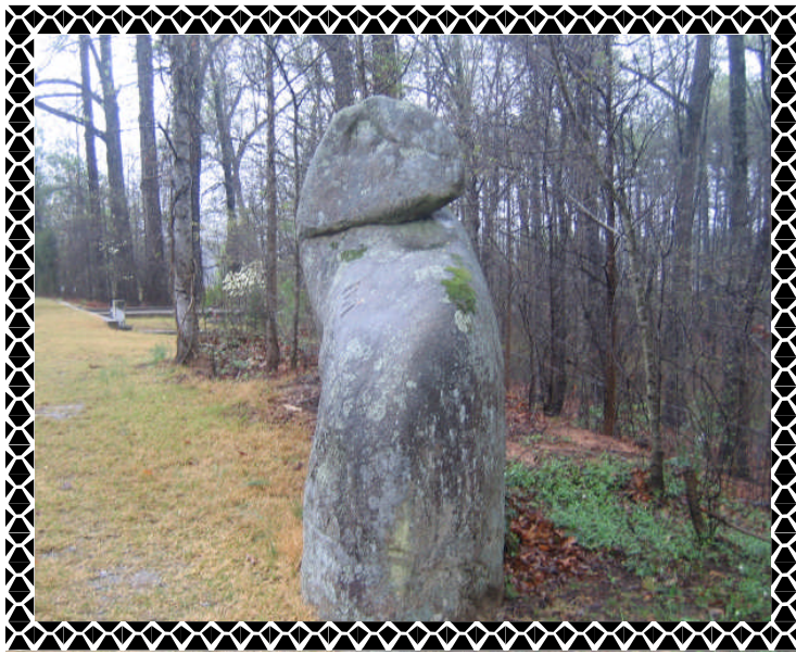
ESRAC field trip to Owl Rock