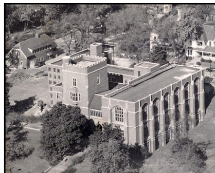
James D. Hoskins Library at UT-Knoxville