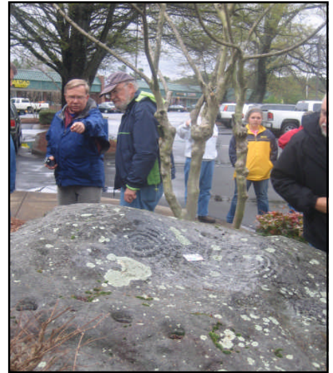
ESRAC field trip to Sprayberry Rock