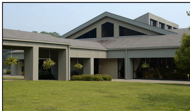
Red Top Mountain State Park Lodge